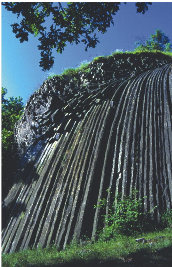
Lokalita č. 41 Šomoška (E 4). Odlučnosť bazaltových stĺpcov tvorí "kamenný vodopád".

Locality 41 Šomoška (E 4). Columnar jointing of basalts forms "stony waterfall".