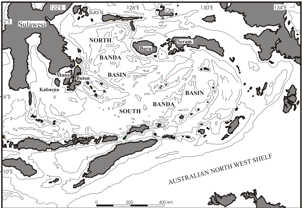
Milsom: Vienna Basin/Little Hungarian Plain - North Banda Sea