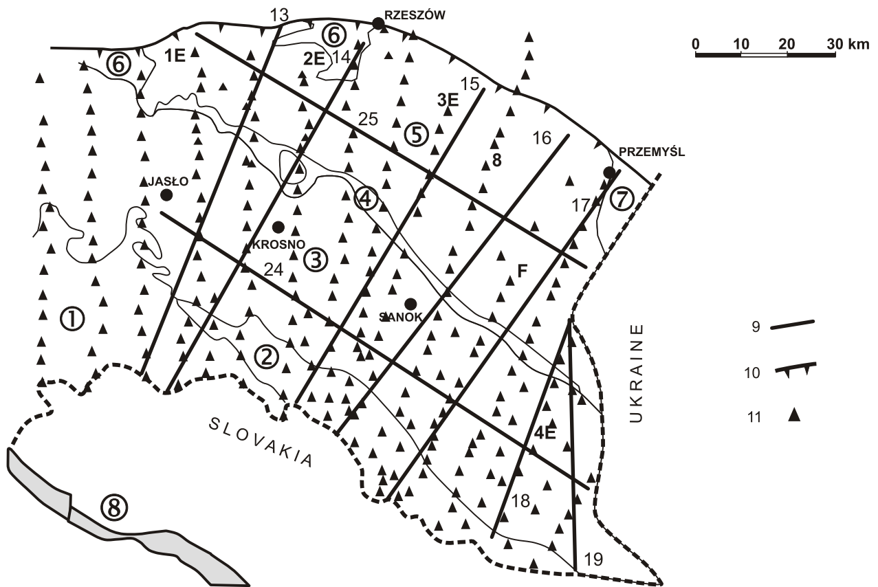
1- Magura Unit, 2- Dukla Unit, 3- Silesian Unit, 4- Subsilesian Unit, 5- Skole Unit, 6- transgressive Miocene, 7- Stebnik Unit, 8- Pieniny Klippen Belt, 9- new magnetotelluric profiles, 10- Carpathian overthrust, 11- older magnetotelluric soundings